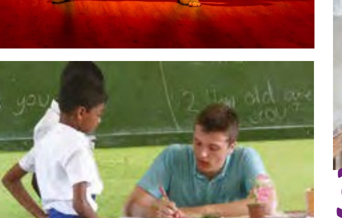
800+ teaching staff