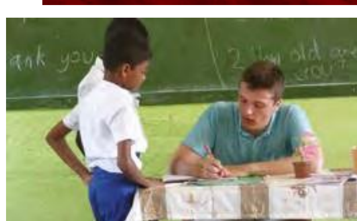
800+ teaching staff