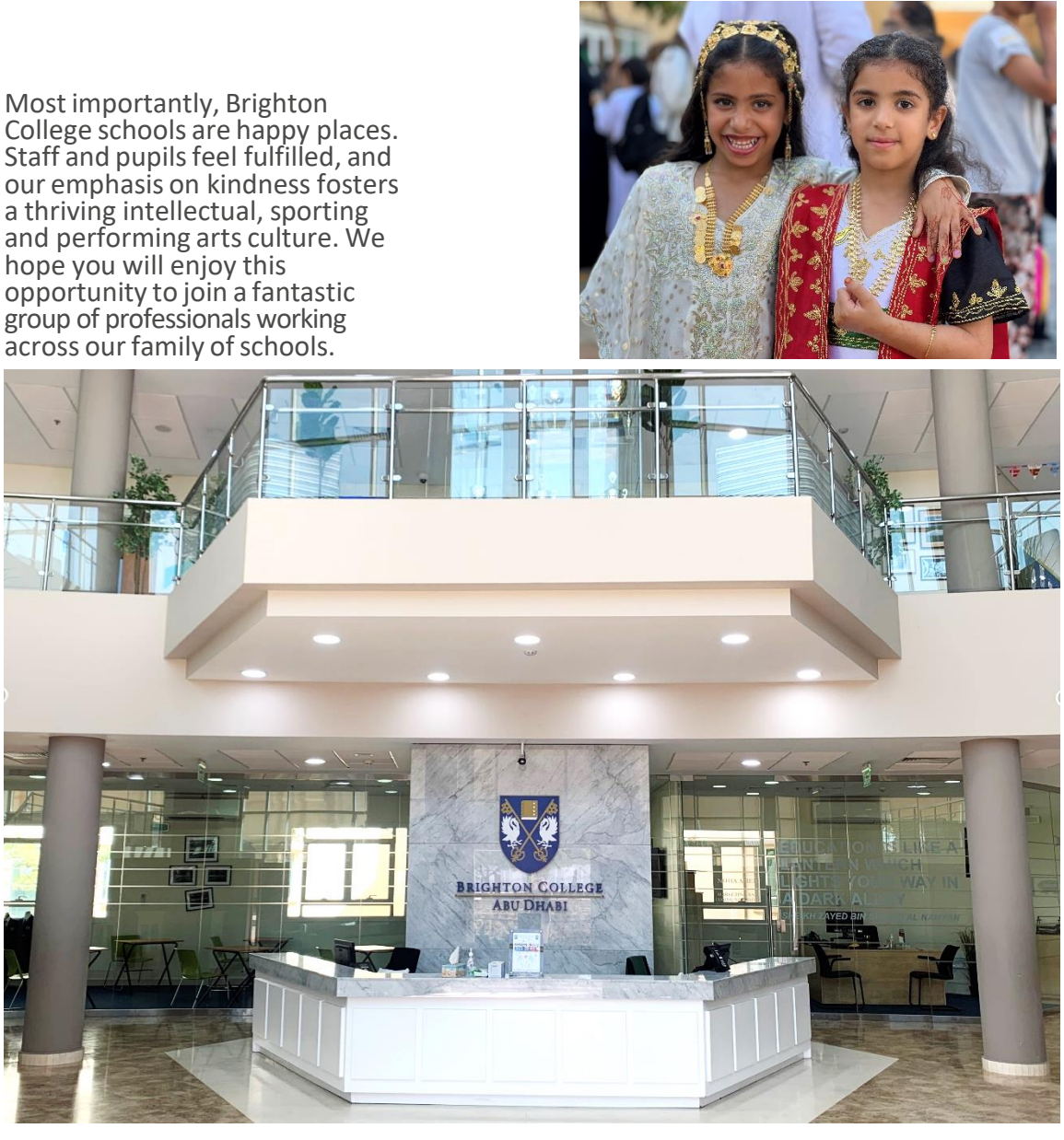
School Parent awards in 2022.

College schools are happy places. Staff and pupils feel fulfilled, and our emphasis on kindness fosters a thriving intellectual, sporting and performing arts culture. We hope you will enjoy this opportunity to join a fantastic group of professionals working across our family of schools.